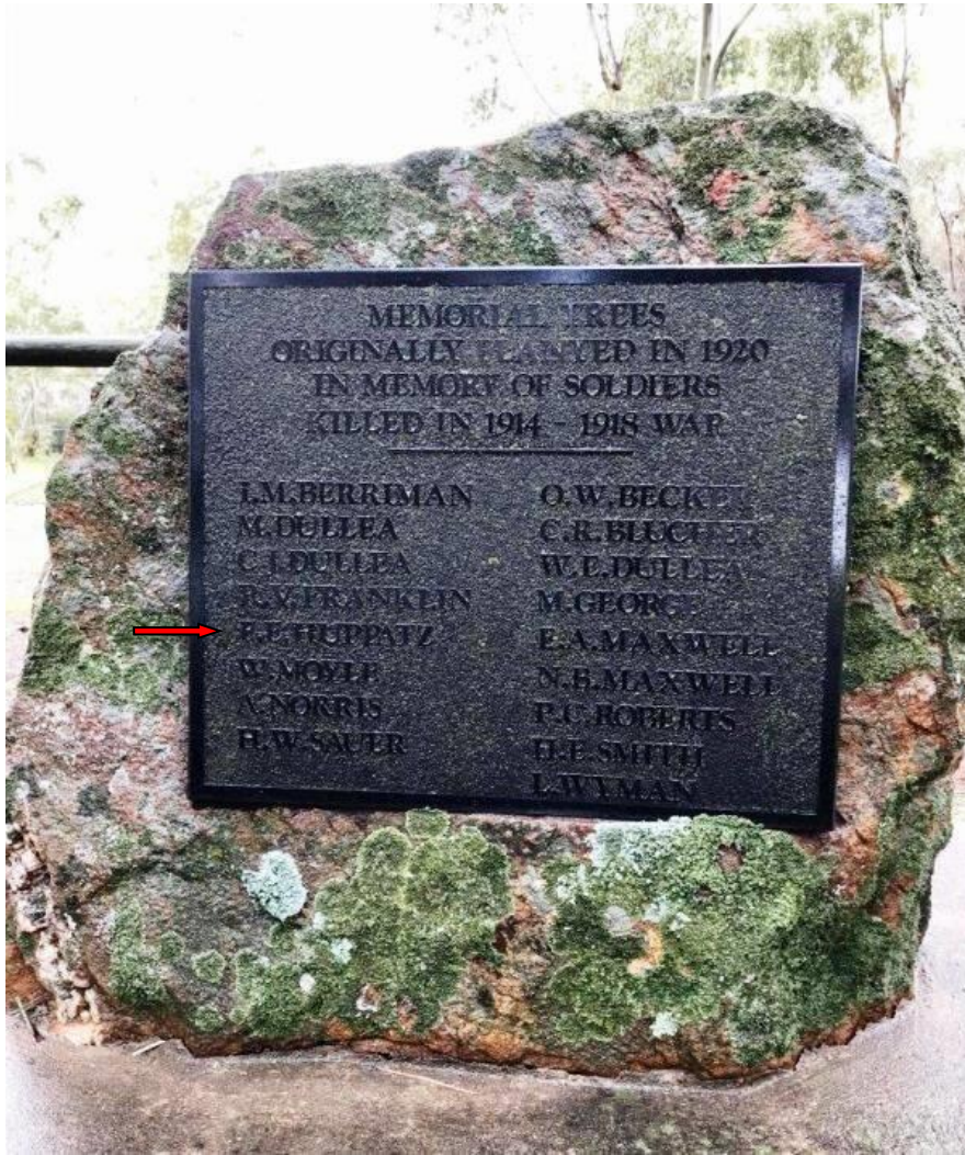
Saddleworth Memorial Avenue