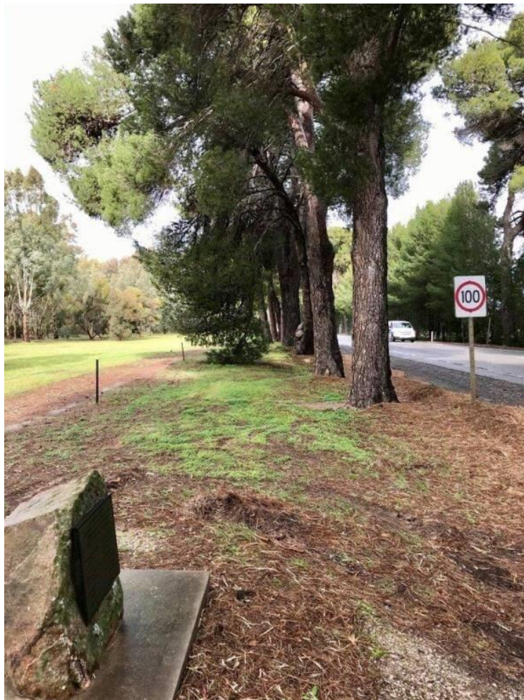
Saddleworth Memorial Avenue