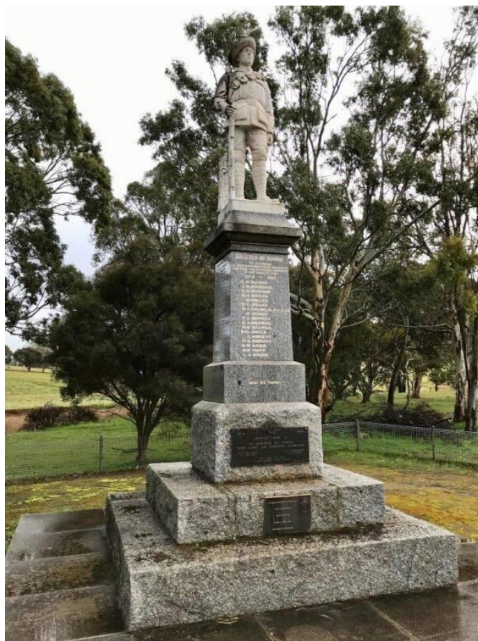
Saddleworth War Memorial